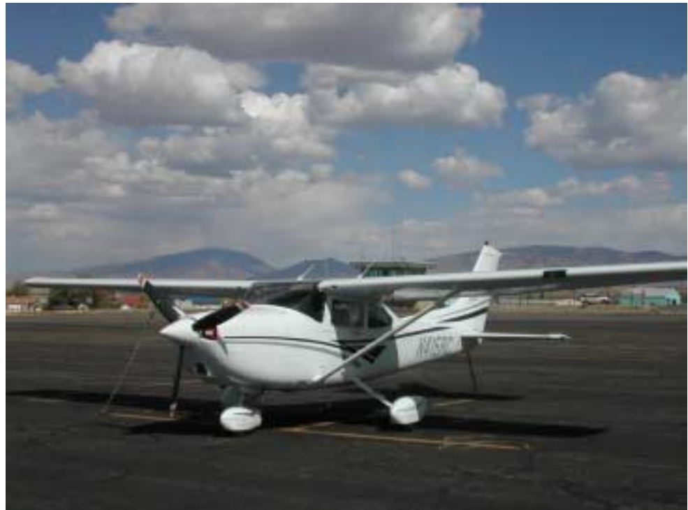
N415RC basking on the ramp in Saratoga, Wyoming