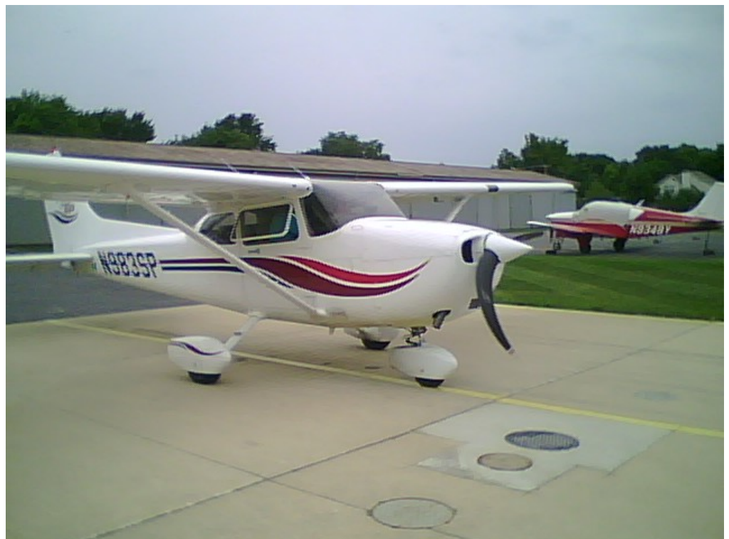
NICE PROP! Actually just a funny camera shutter