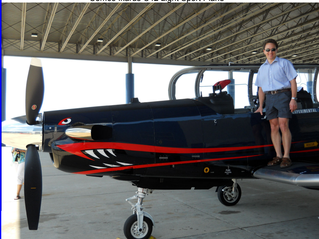
Hawker Beechcraft T-6C Texan II