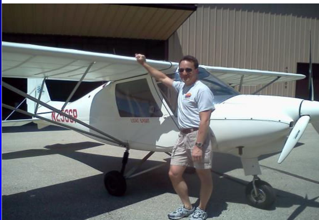
Comco Ikarus C42 Light Sport Plane

Tuesday, September 4, 2012 5:00pm plane wash - 7:30 meeting