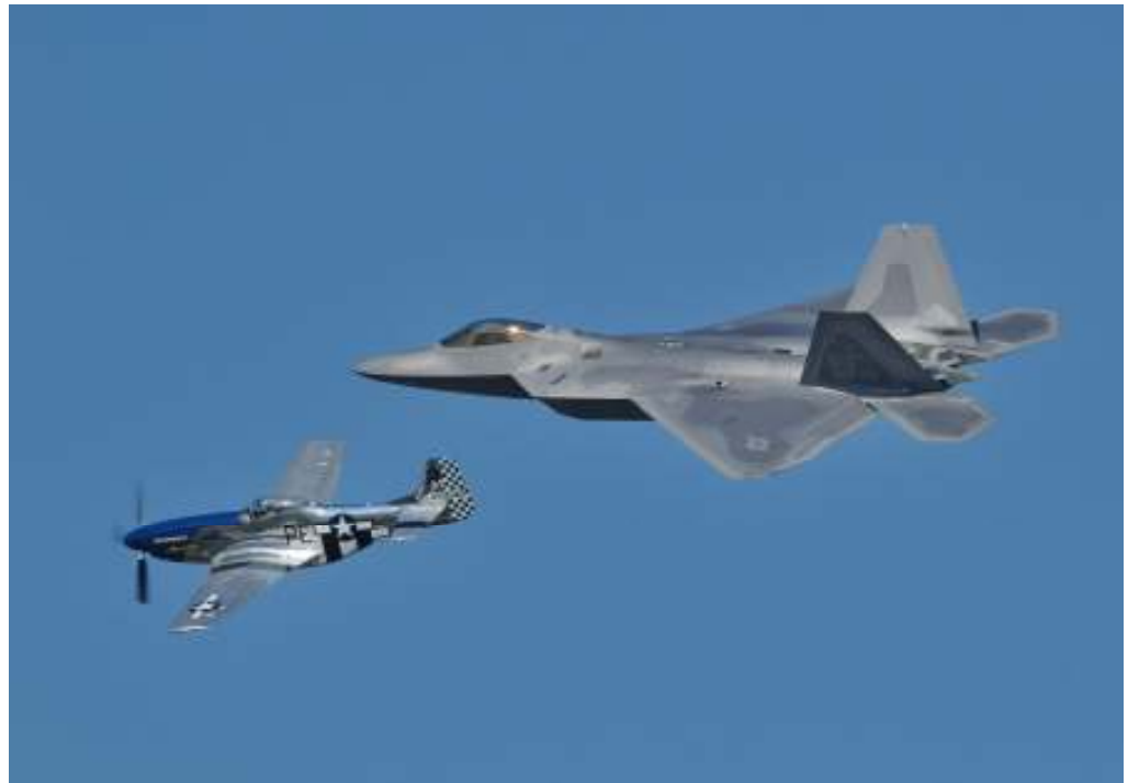
Oshkosh 2008 heritage flight

Tuesday, Aug. 7, 2012 5:00pm wash - 7:30 meeting