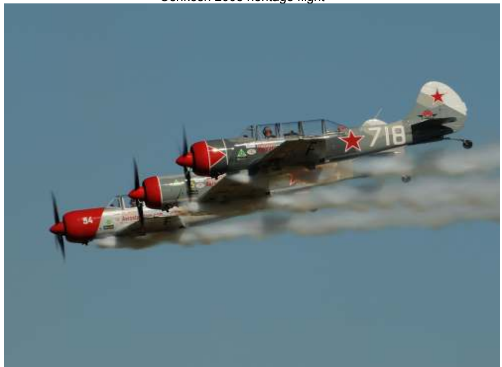
Oshkosh 2011 Yak attack