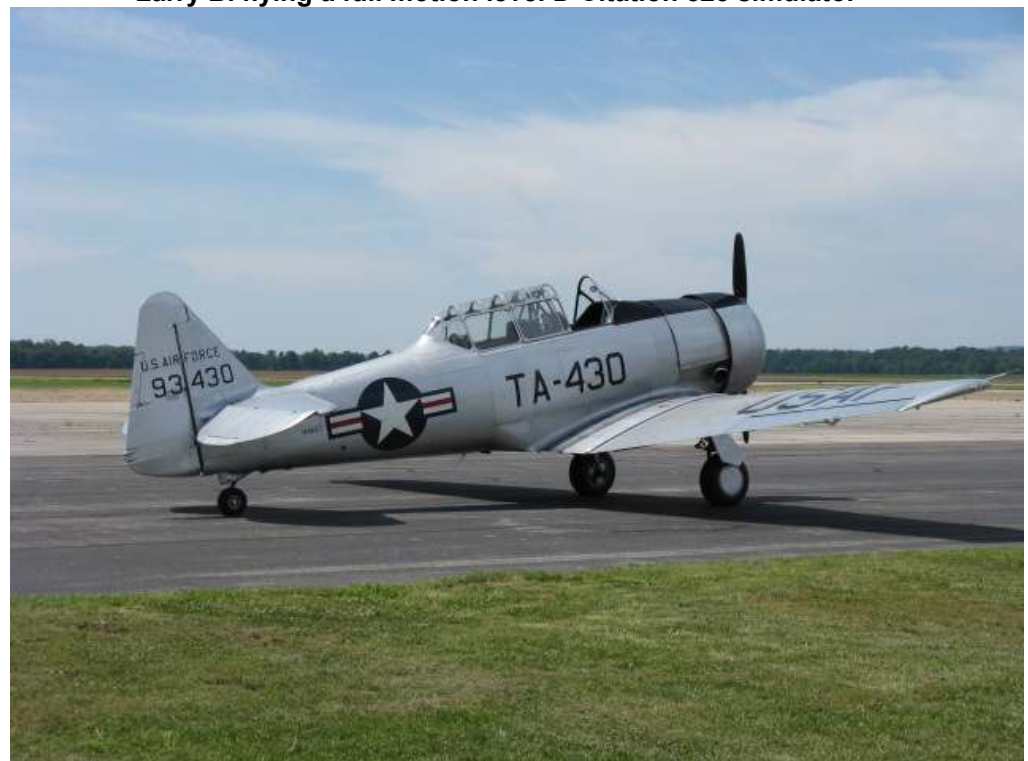
Larry B. flying in a T-6