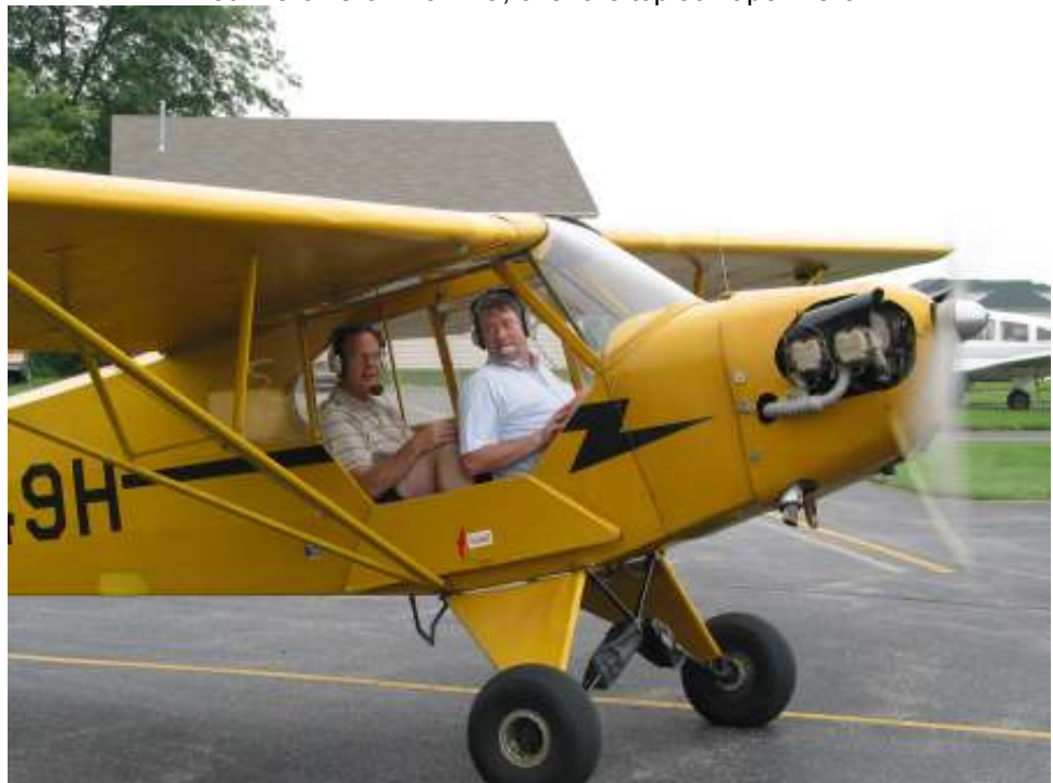
Treasurers have all the fun!