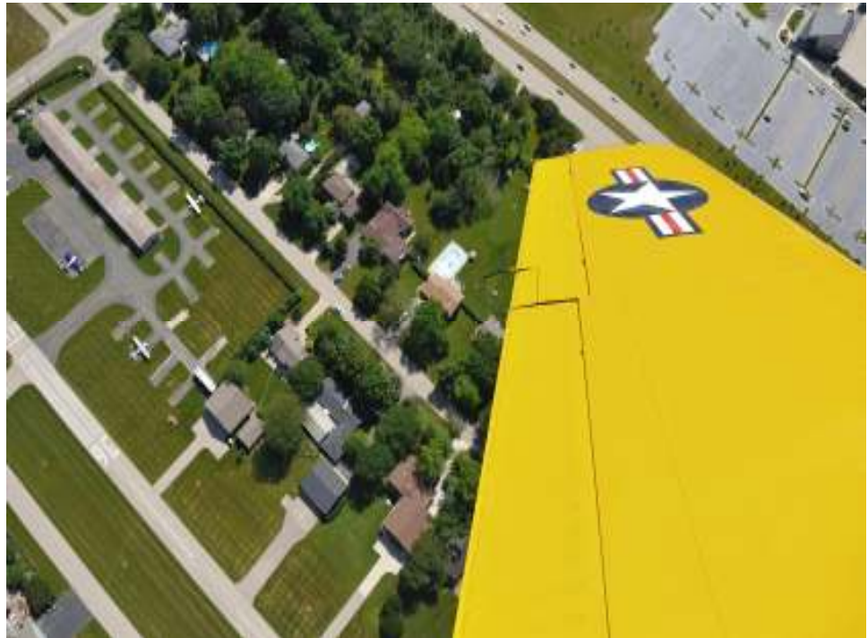
Four zero zero lima lima, over the top at Naper Aero.