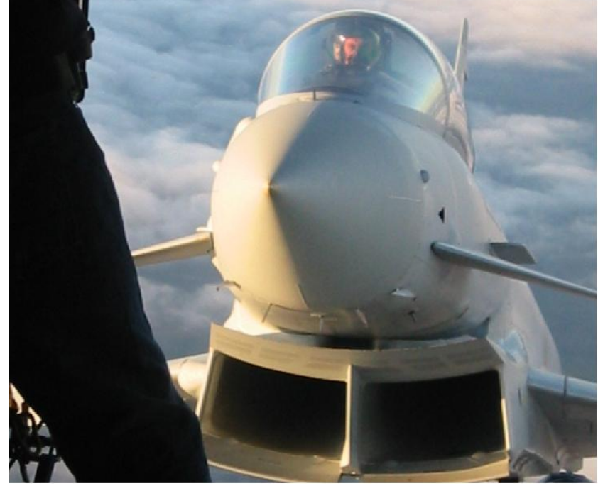
THANKS TO AL LOEK FOR THESE PICTS!!