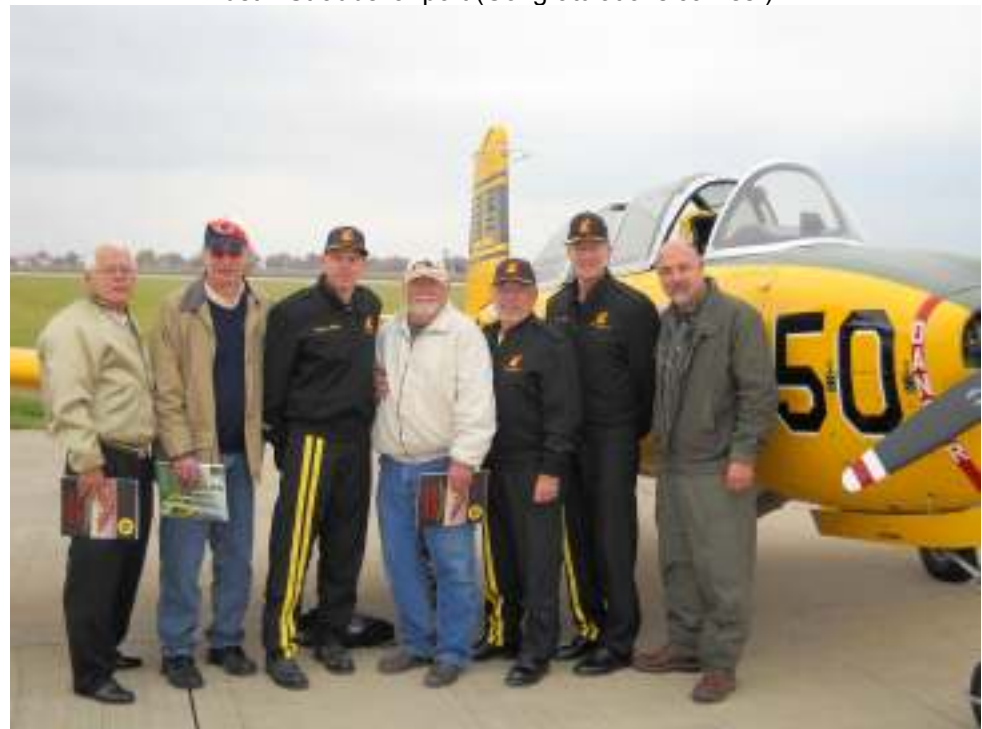
Remember our veterans!