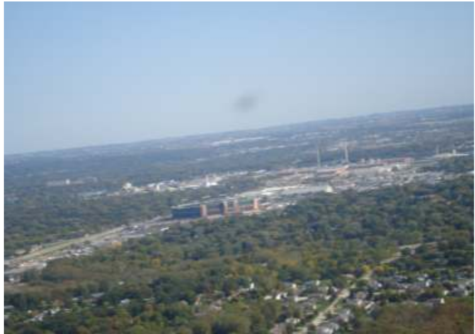
Austin Straubel airport (Congratulations James!)

NEXT MEETING: Tuesday, December 6, 2011 7:30PM