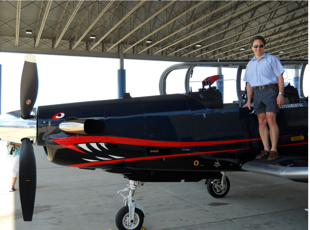
Hawker Beechcraft T-6C Texan II