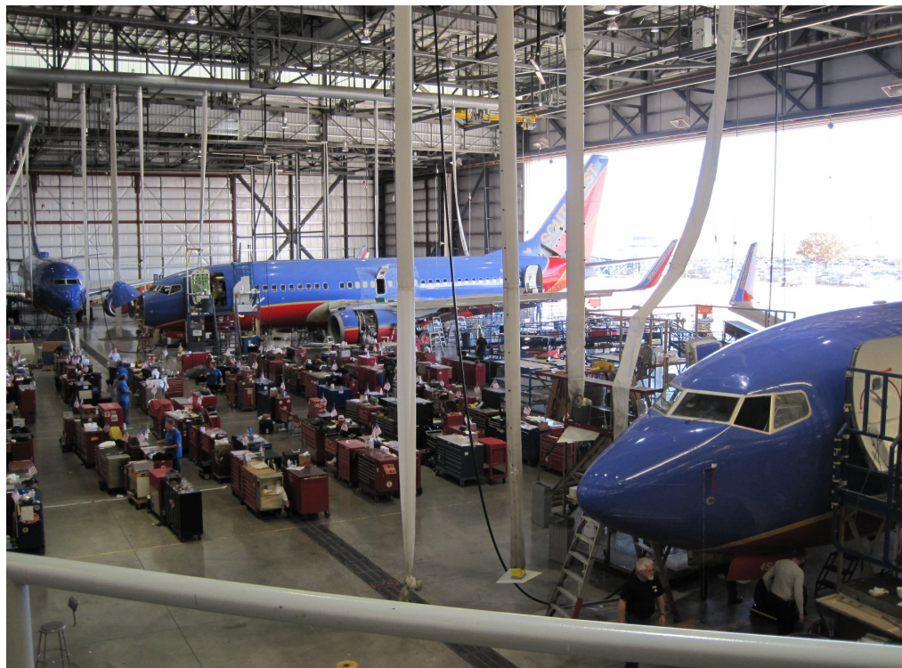
Southwest Airlines Maintenance Hangar – Dallas

NEXT MEETING: Tuesday, March 6, 2012 7:30PM