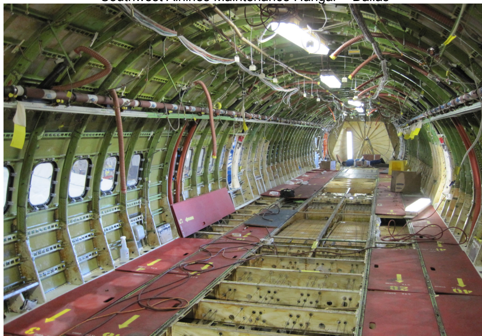
737 - undergoing a 24Y check, amazingly out of service only 60 days