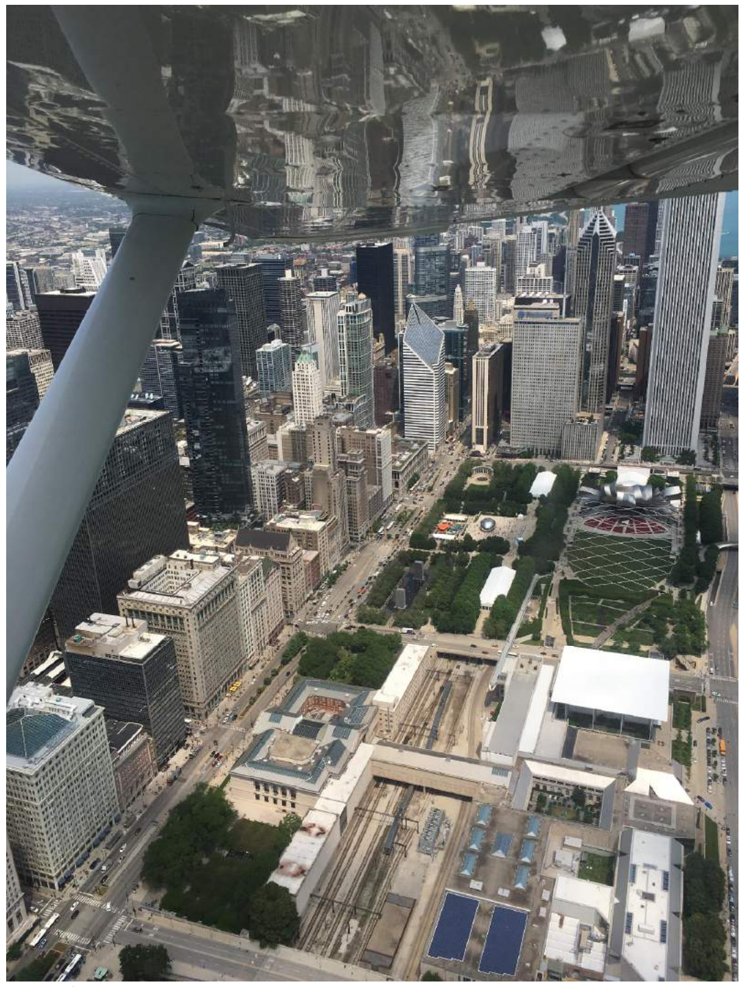
Chicago's Millennium Park